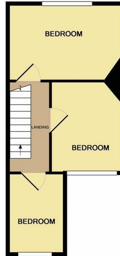
1ST FLOOR APPROX. FLOOR AREA 329 SQ.FT. (30.6 SQ.M.)