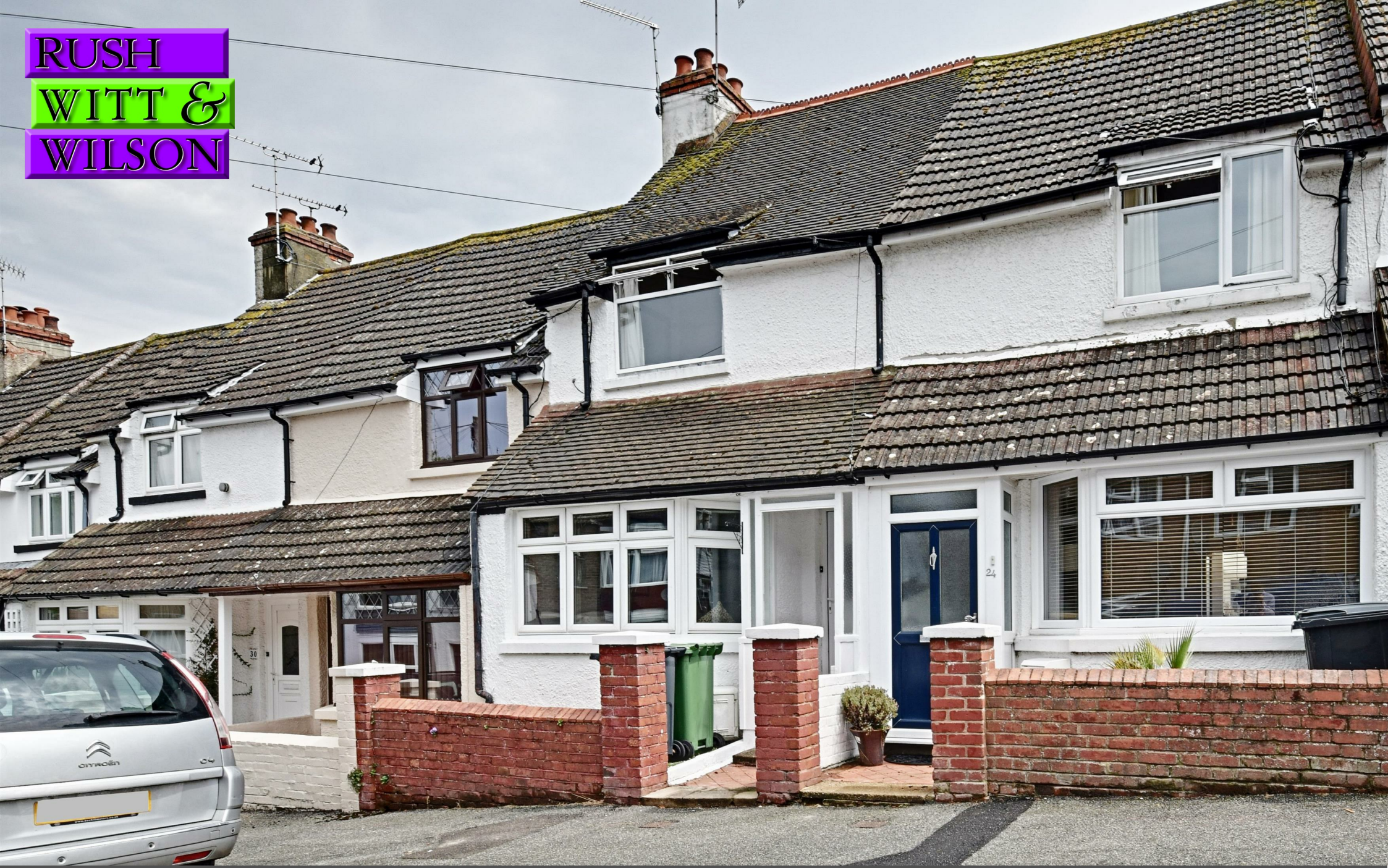
26 Silvester Road, Bexhill-On-Sea, East Sussex TN40 2AY £225,000